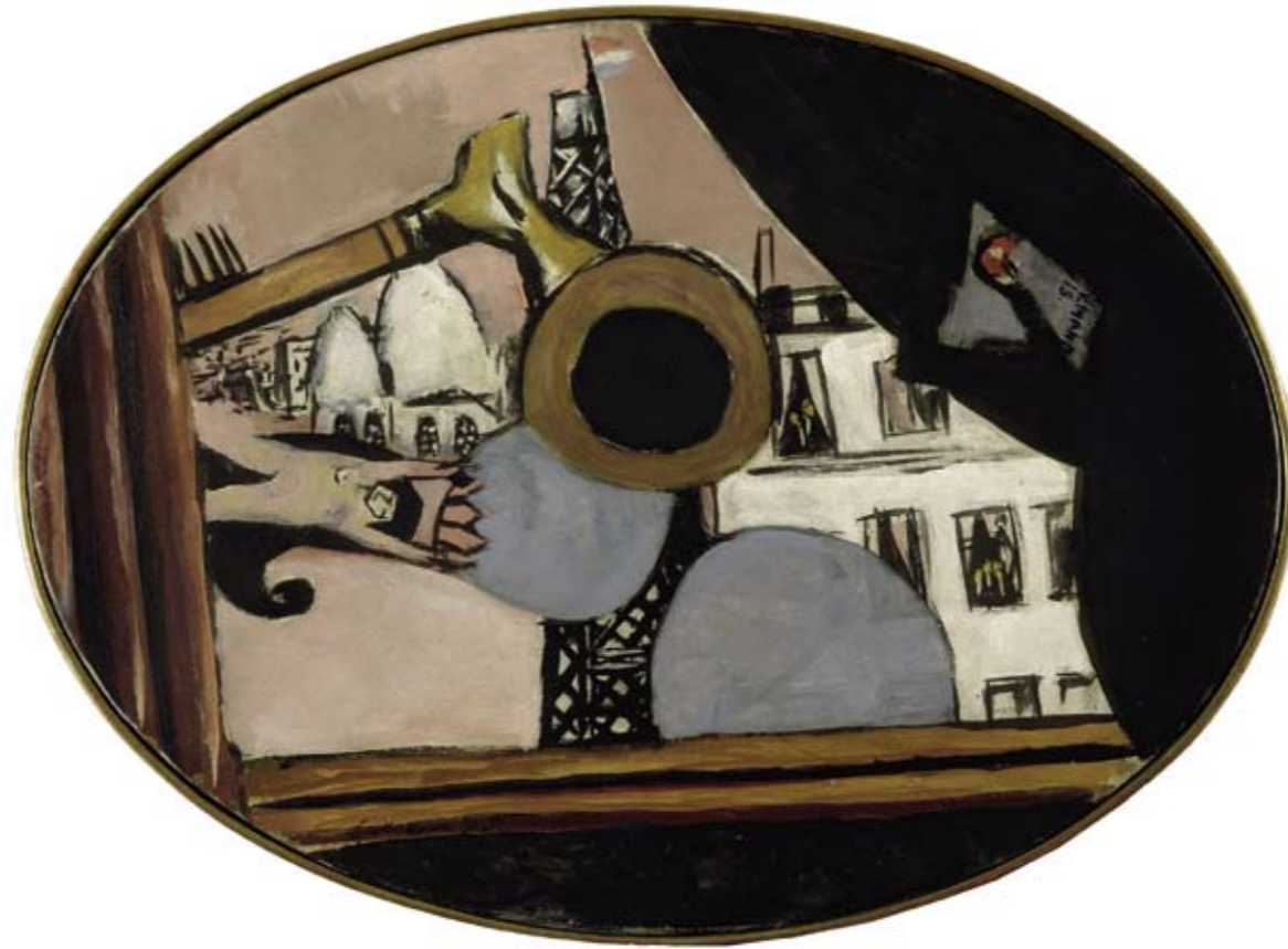
MAX BECKMANN „REVE DE PARIS“, 1931 © VG BildKunst, Bonn 2008